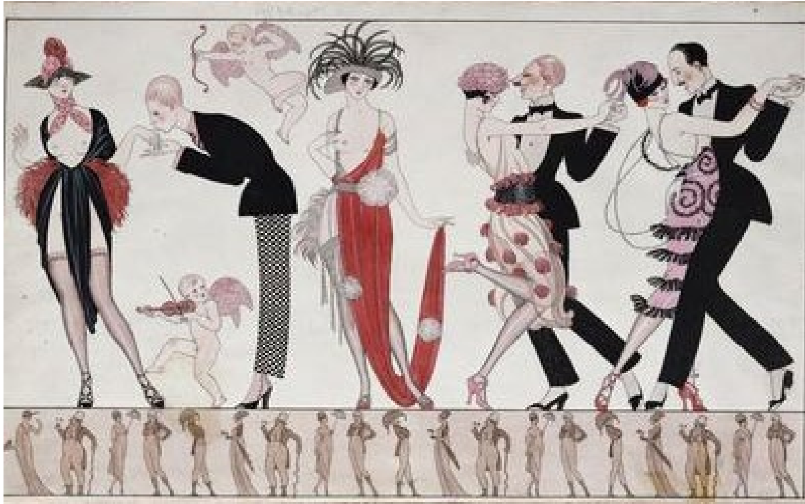
“A Time to Cherish” WIPAC FALL GALA